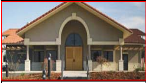
WALLA WALLA VITICULTURE COLLEGE