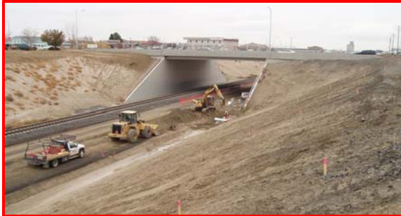
COLUMBIA BLVD GRADE SEPARATION