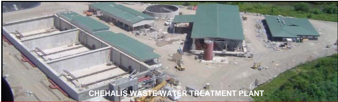
CHEHALIS WASTE WATER TREATMENT PLANT

Apollo operates as a Small Disadvantaged Business Concern (SDB) per new federal regulations which outlines the rights of an Indian-owned Economic Enterprise.” Per recent changes made to the Federal Acquisition Regulation, specifically FAR 52.219-9 Small Business Subcontracting Plan (Oct 1999).